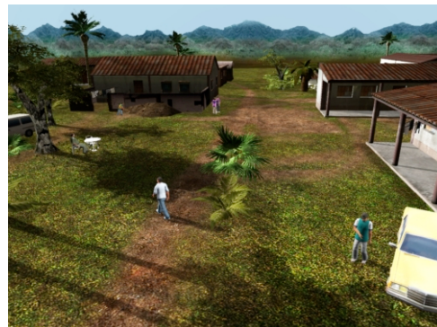
Screenshots: Global Conflicts: Palestine (2007) & Global Conflicts: Latin America (2008)

In 2008, we introduced the sequel, “Global Conflicts: Latin America”. Latin America is one of the most turbulent, violent and poverty-stricken places on the planet. Yet it is only when Western interests in the region are threatened that we hear anything about the nations that struggle with paramilitary rule, extreme poverty and exploitation of the population. We wanted to direct attention to these issues. The question for the players in the game is whether they can make a difference by writing investigative stories. The game is available in English, German, French, Spanish, Swedish, Norwegian and Danish languages.