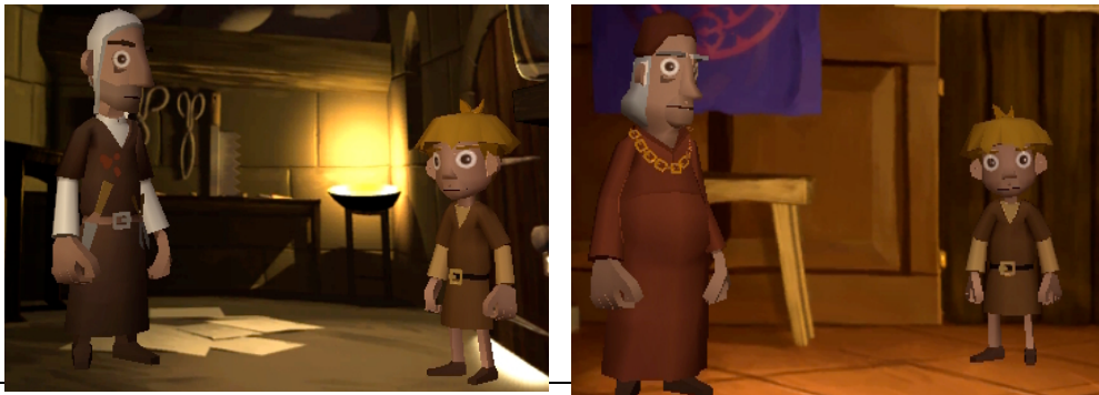
Screenshots: Playing History Episode 1: The Black Plague (E2009).

The first game is about, the plague pandemic first known as 'the Great Dying' and later as 'the Black Death' arrived from Central Asia in the mid-fourteenth-century to afflict three other regions of the world – Europe, the Middle East, and Northern Africa. The disease was carried by infected fleas that travelled on the backs of rats, clothing, bedding, and even human hair and first arrived in European ports from where it quickly spread its deadly fingers throughout much of the populated world. Although the topic is serious, the game will be fun, enlightening and highly engaging!