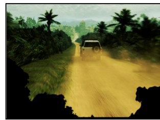
Screenshots from Serious Games Interactive productions, 2009 ©

Since our inception in 2006, we have aimed to develop enriching and engaging games with a strong focus on integrating the gaming and learning experience. Playing computer games has evolved into one of the most popular activities for people to entertain themselves. Yet, the potential of using games for serious purposes such as education, training, information and marketing remains largely unlocked.